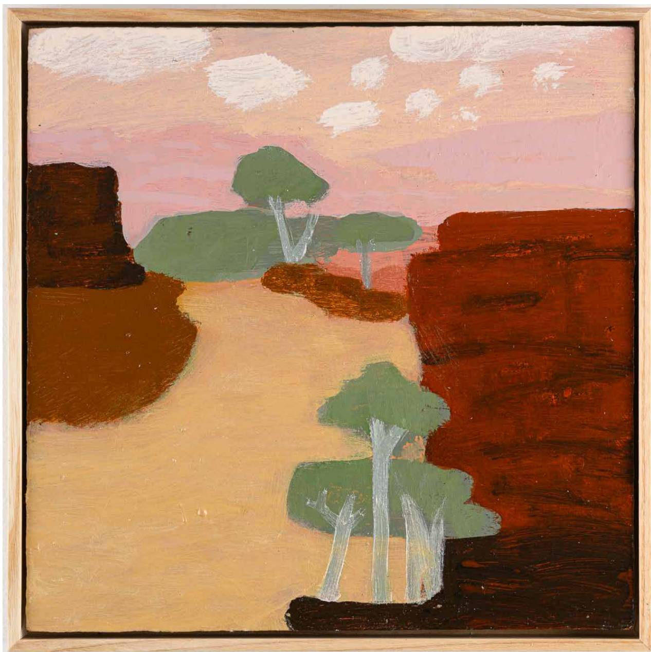
Downriver , 2025, acrylic on birch, 320 x 320 mm $1250