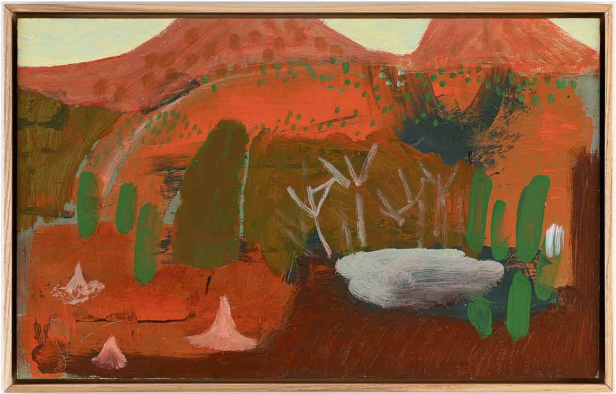
Road trip to Uluru, 2024, acrylic on birch, 320 x 510mm $1600