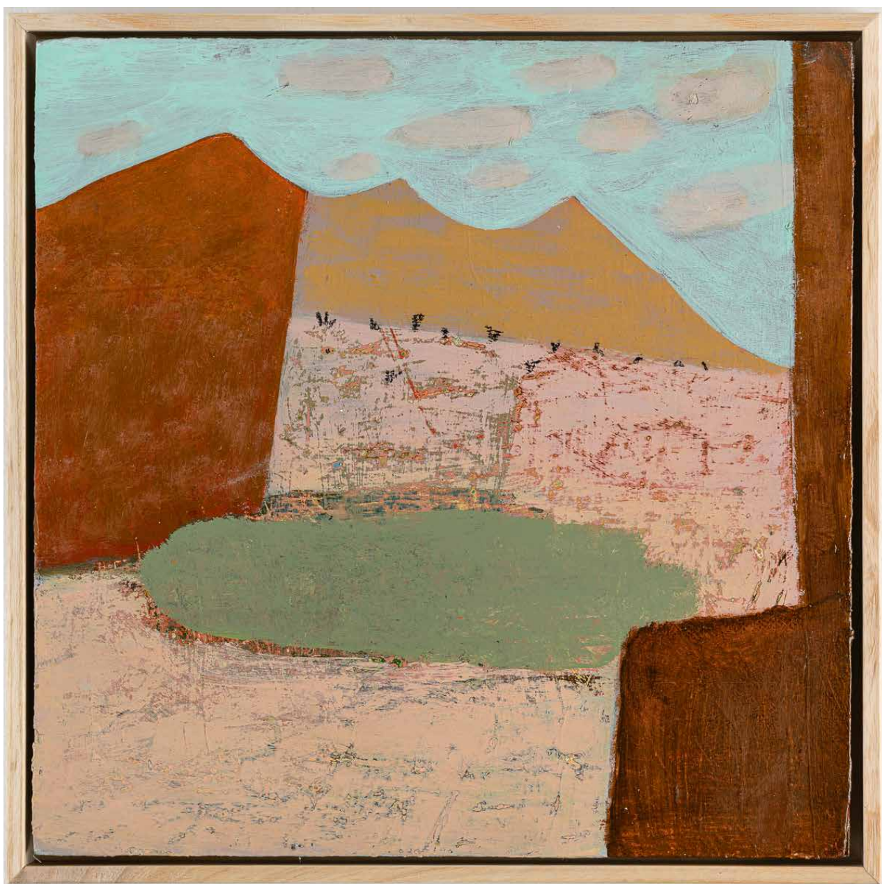
A whole lot of not muchness , 2025, acrylic on birch, 320 x 320 mm $1250