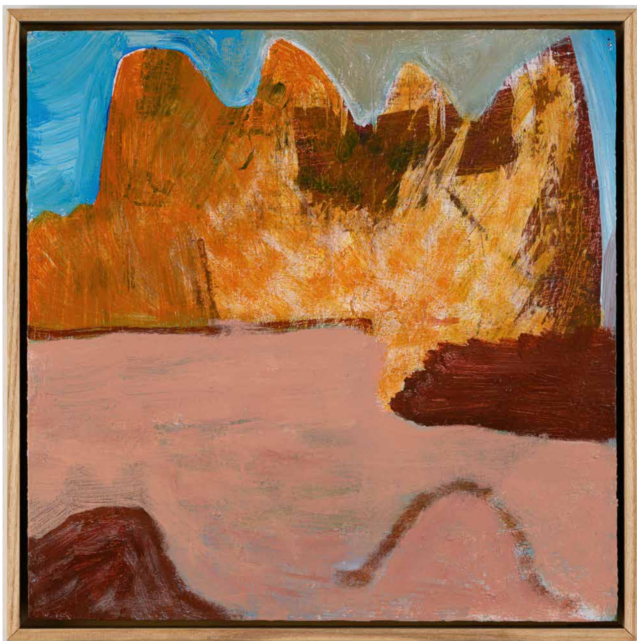
Elsewhere , 2025, acrylic on birch, 320 x 320 mm $1250