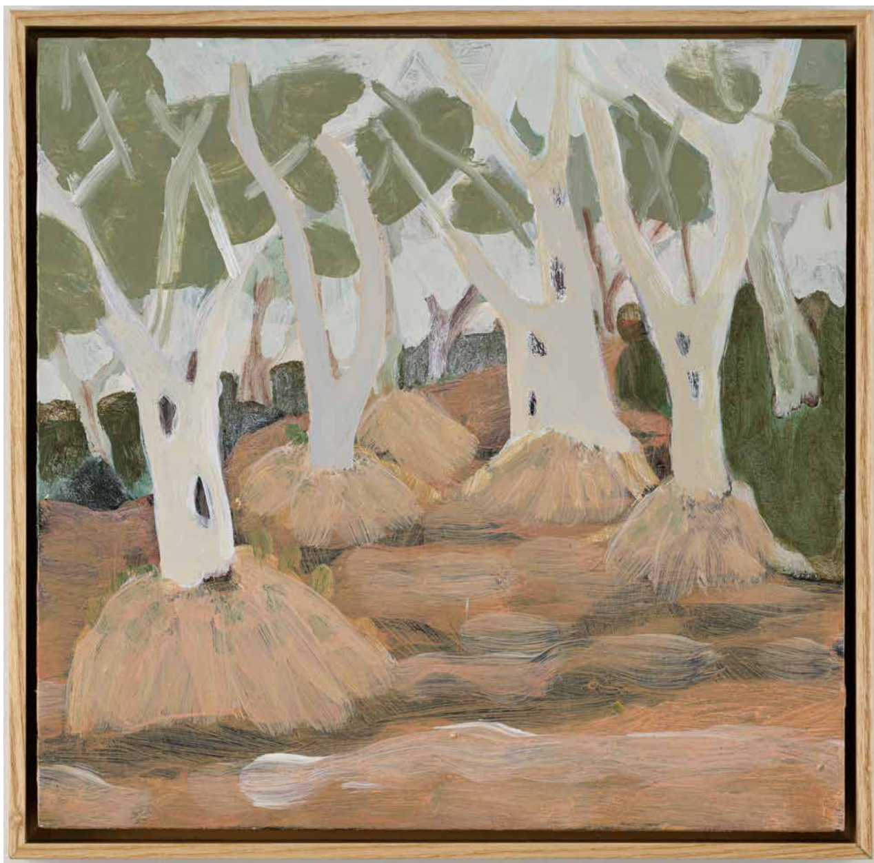
Thinking about infinity , 2024, acrylic on birch, 320 x 320 mm $1250