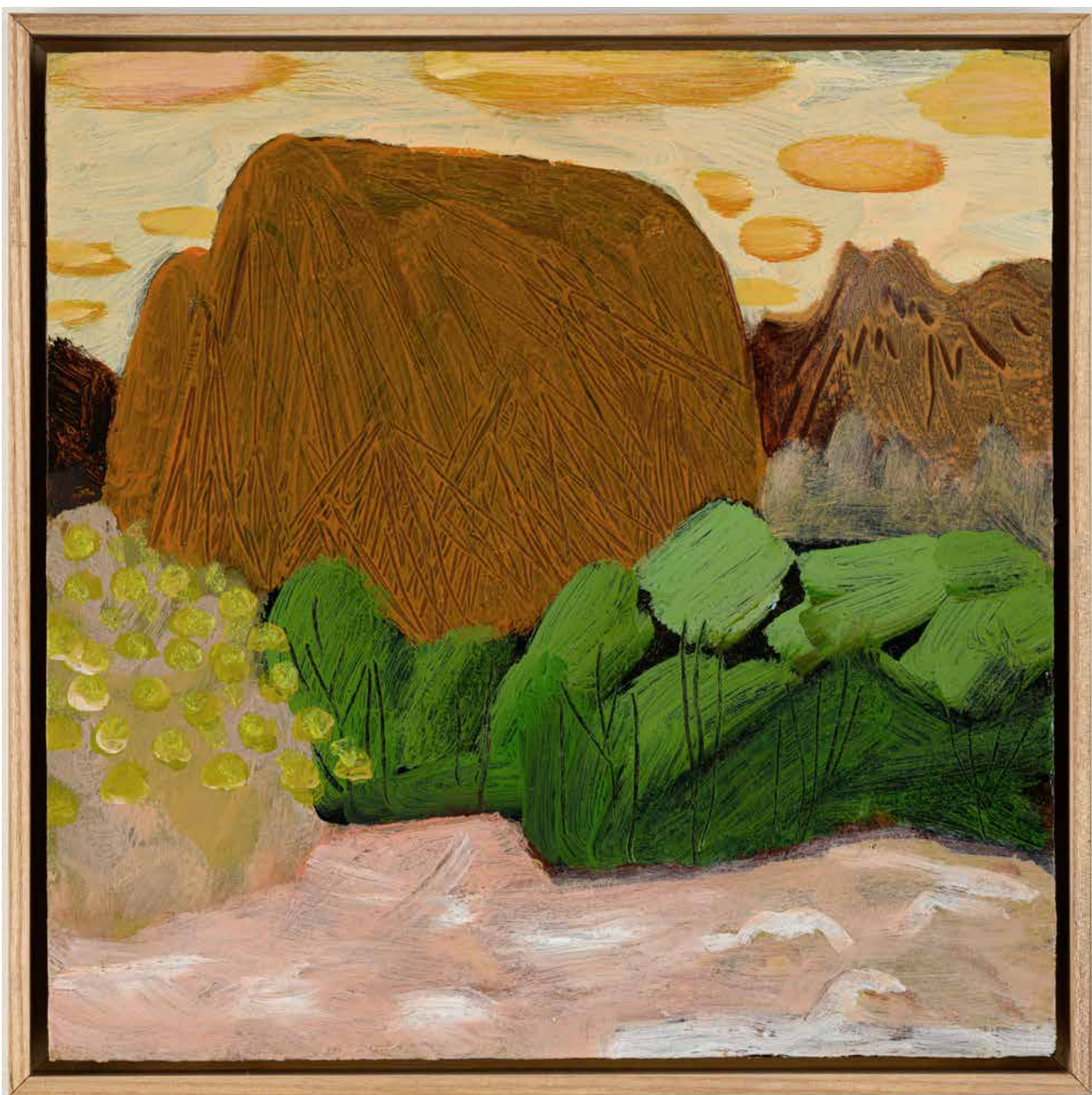
Crow song , 2024, acrylic on birch, 320 x 320 mm $1250