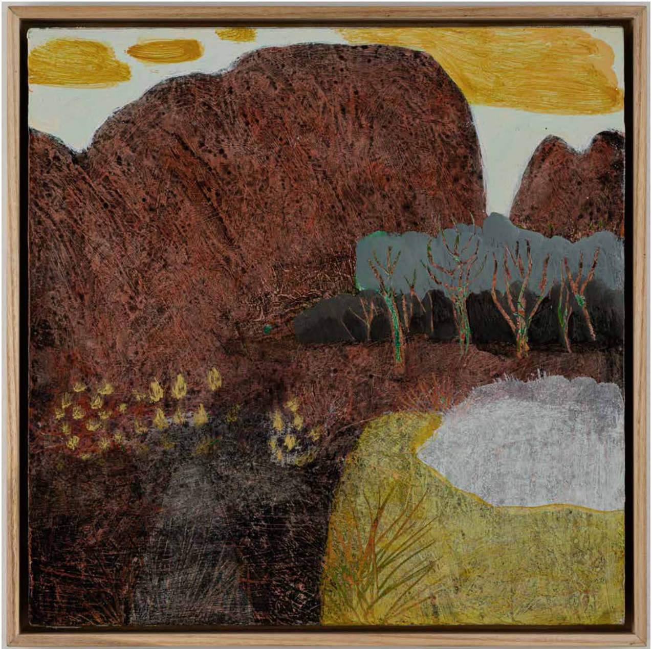
Flight of the budgerigar , 2025, acrylic on birch, 320 x 320 mm $1250