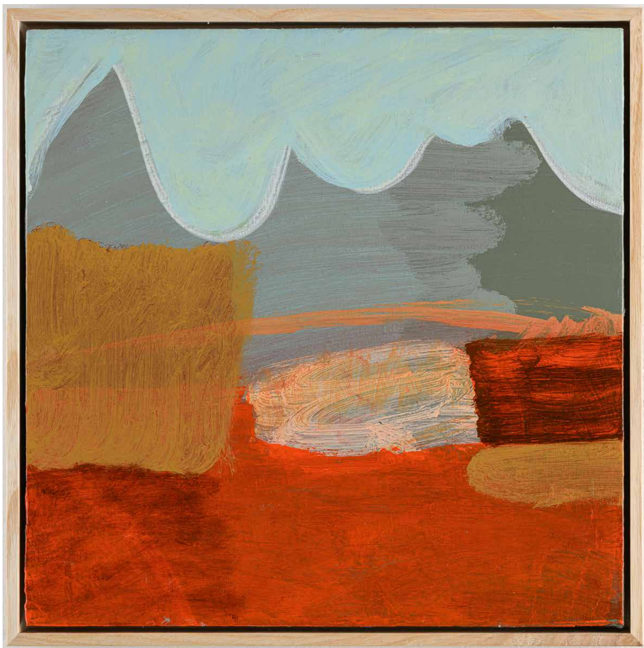
Luminous , 2025, acrylic on birch, 320 x 320 mm $1250