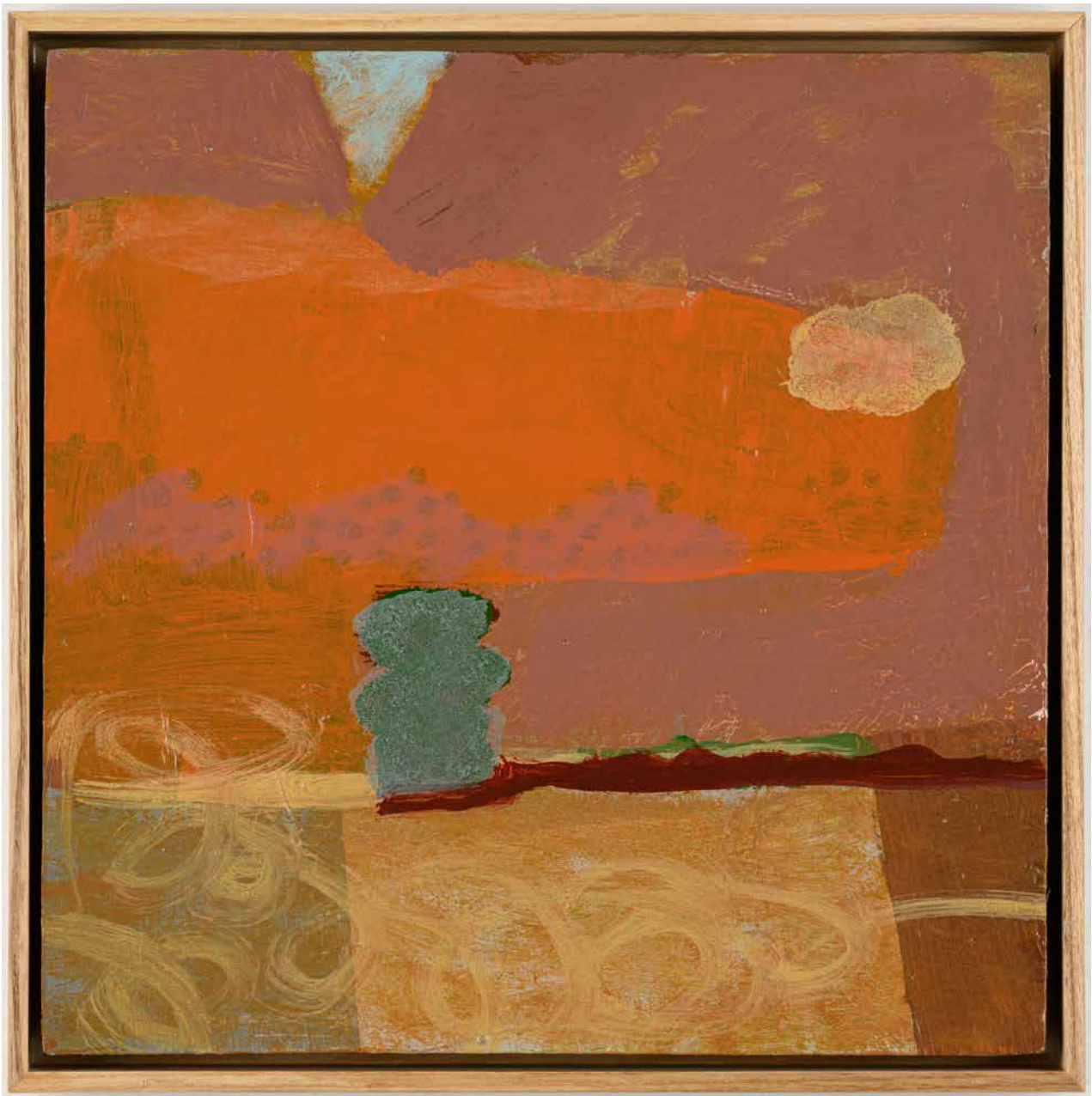
The observer , 2025, acrylic on birch, 320 x 320mm $1250