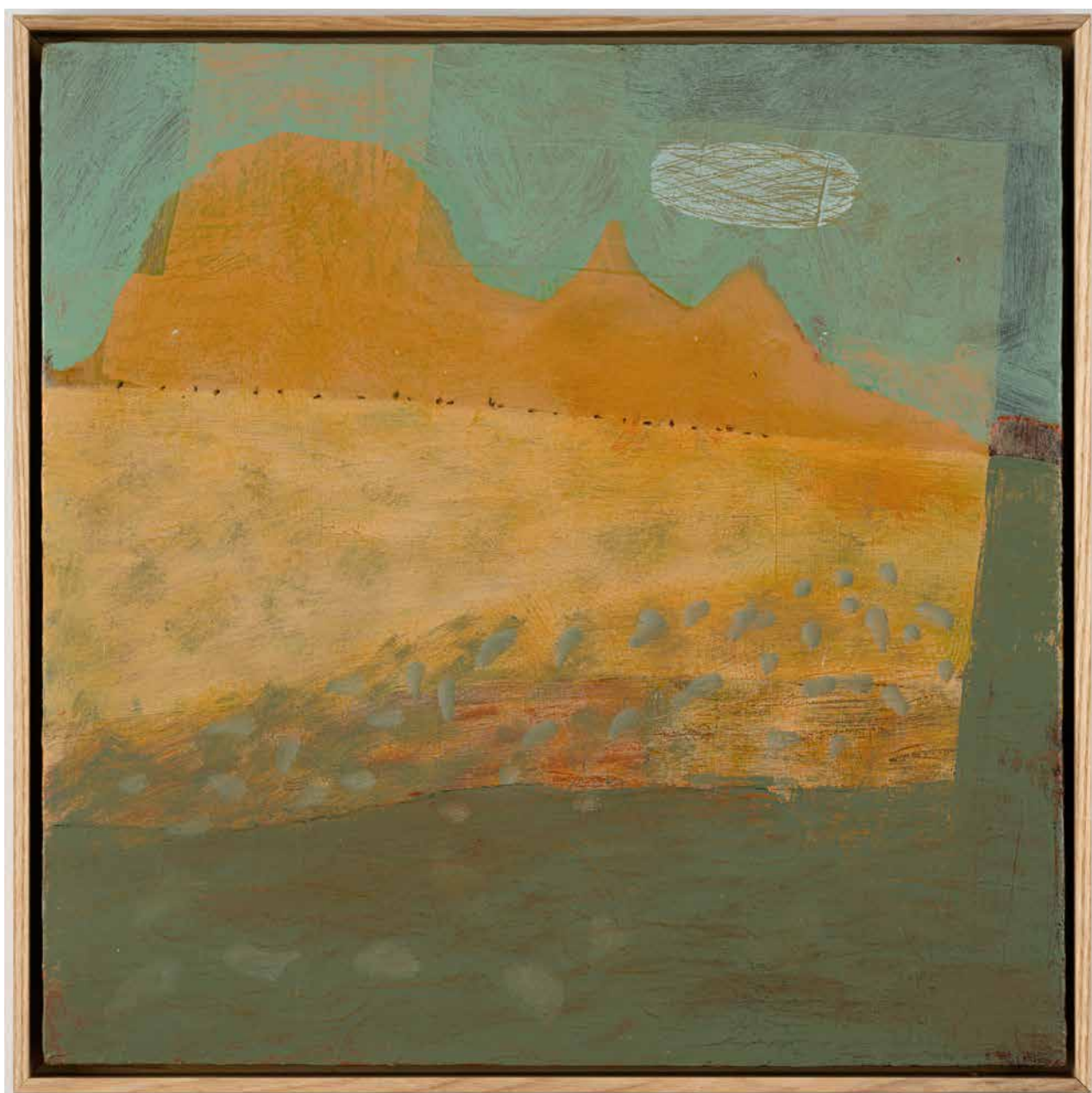
A time and a place , 2025, acrylic on birch, 425 x 425 mm $1600