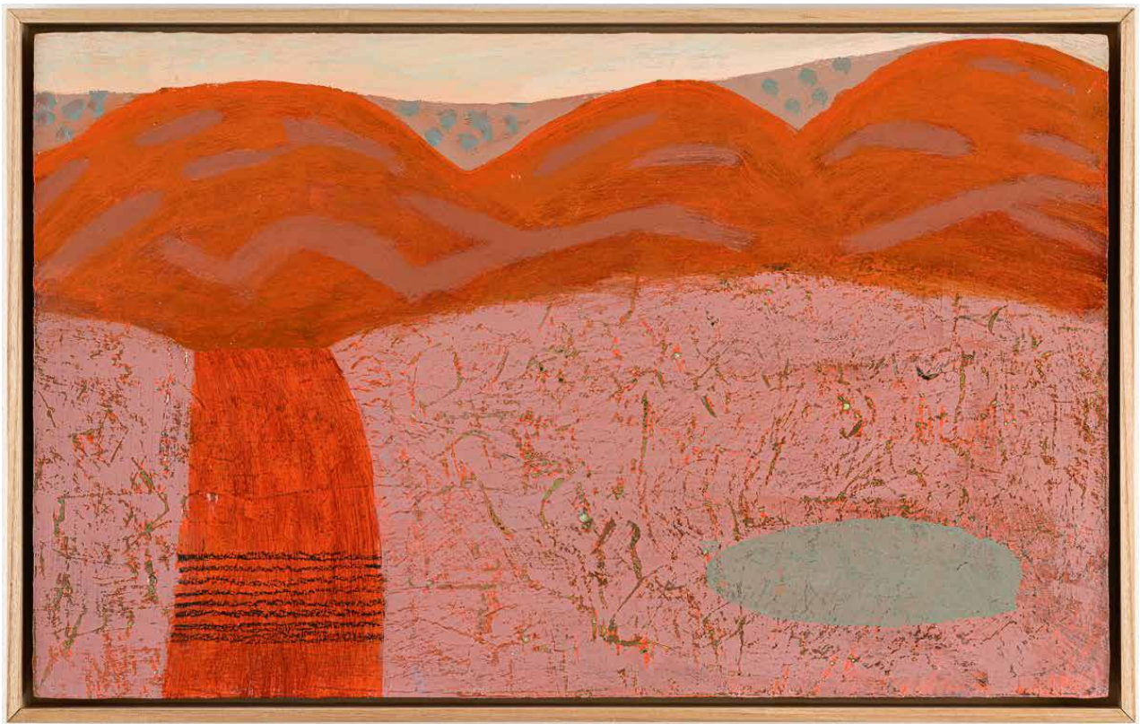
Grid , 2025, acrylic on birch, 320 x 505 mm $1600