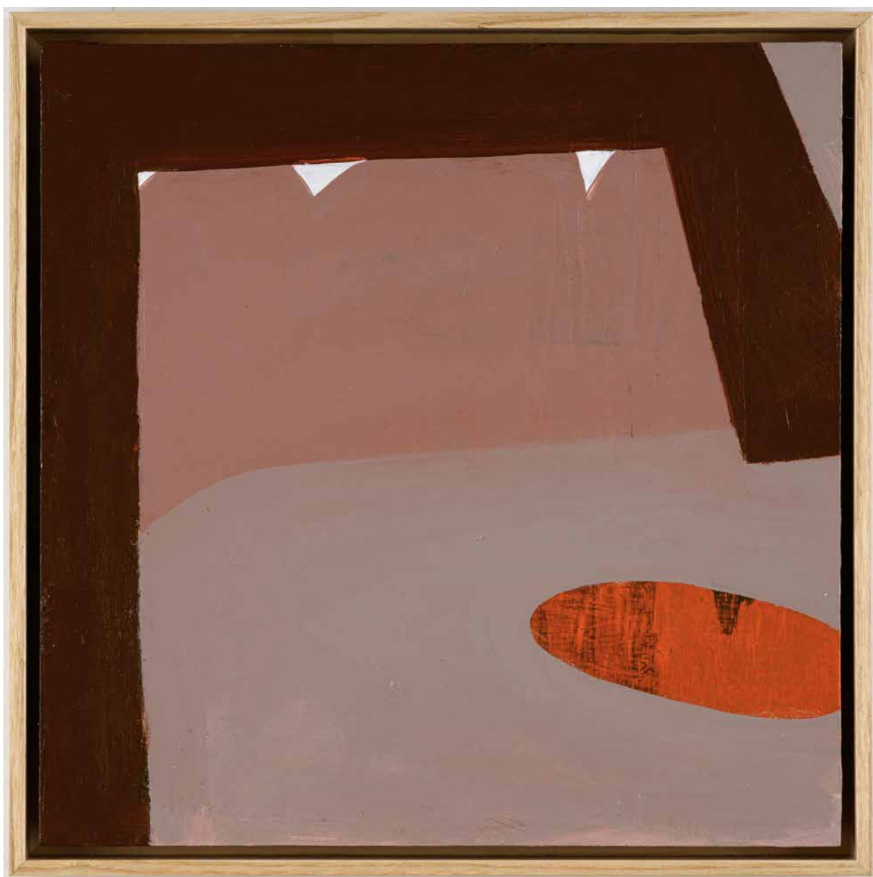
Listening to the landscape - Arltunga, 2025, acrylic on birch, 320 x 320 mm $1250