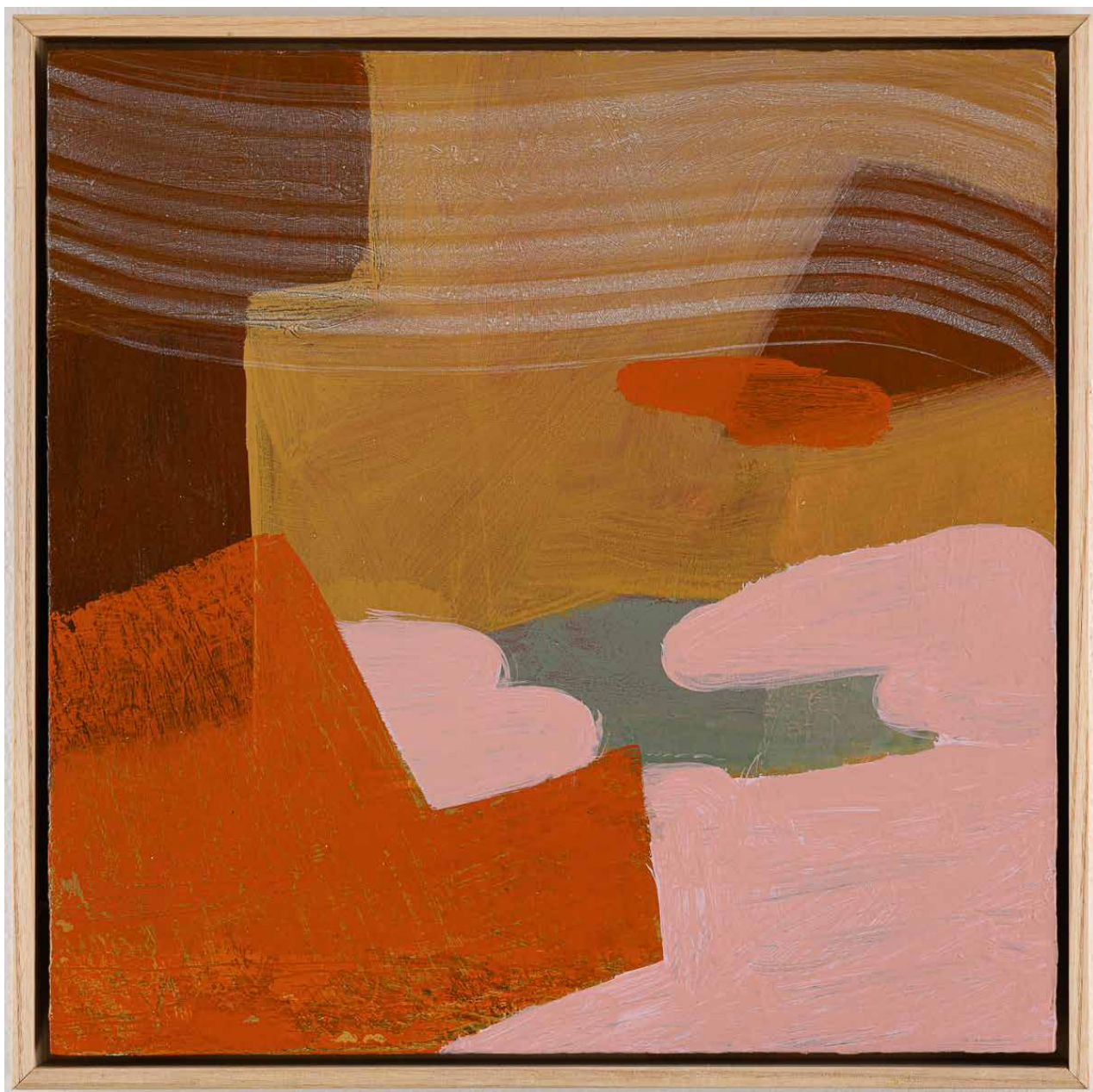
Interior landscape , 2025, acrylic on birch, 320 x 320 mm $1250