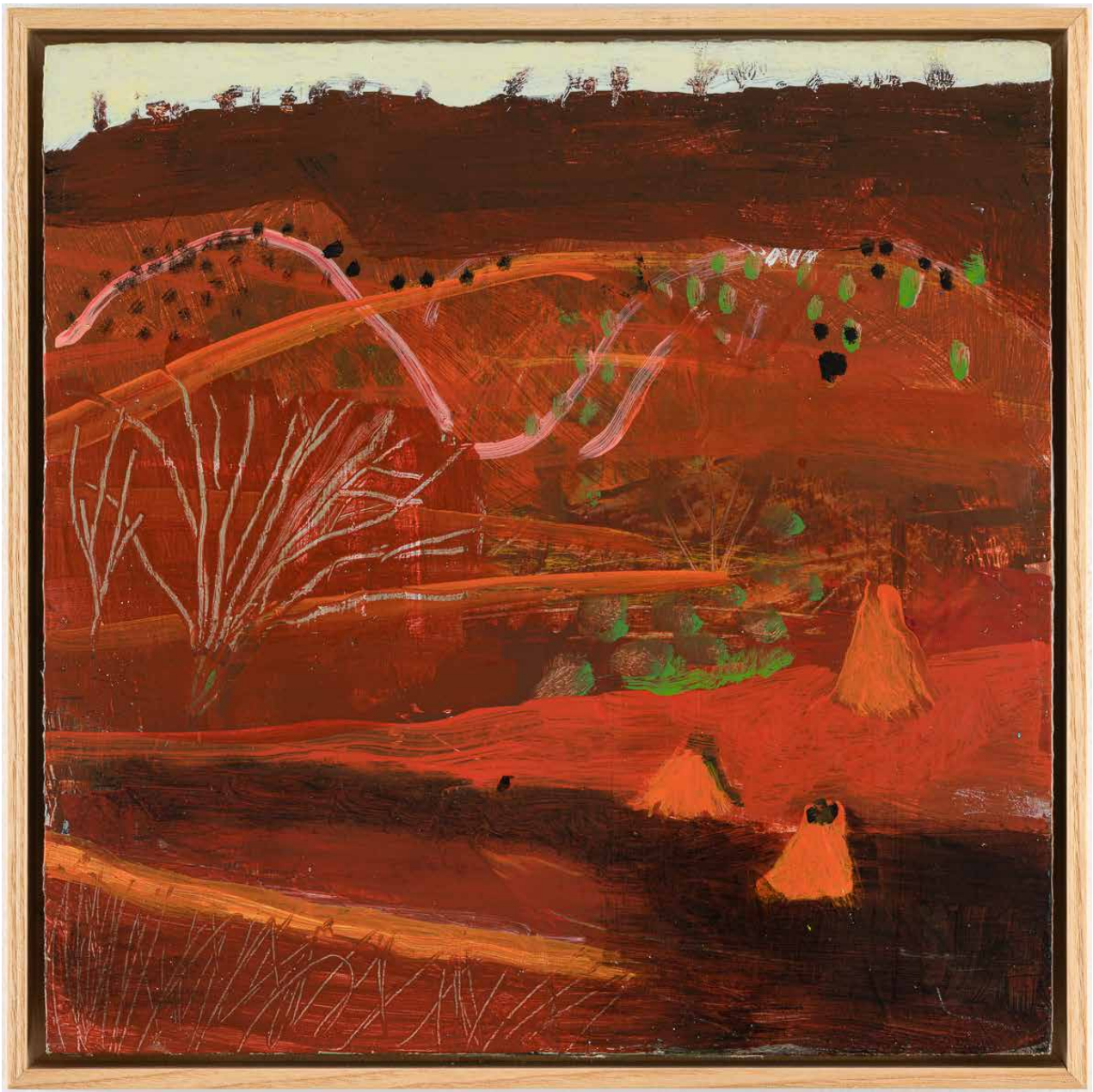
Dotted landscape , 2024, acrylic on birch, 320 x 320 mm $1250