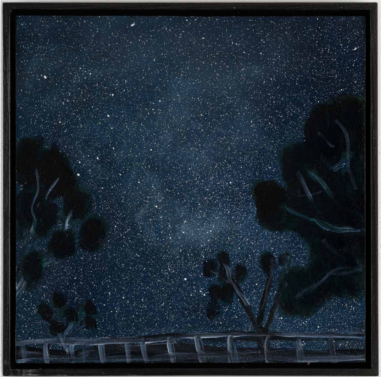
Two blues and a black , 2025, acrylic on birch, 320 x 320 mm $1250