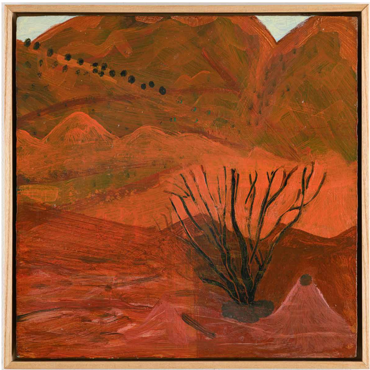
Passenger , 2024, acrylic on birch, 320 x 320 mm $1250