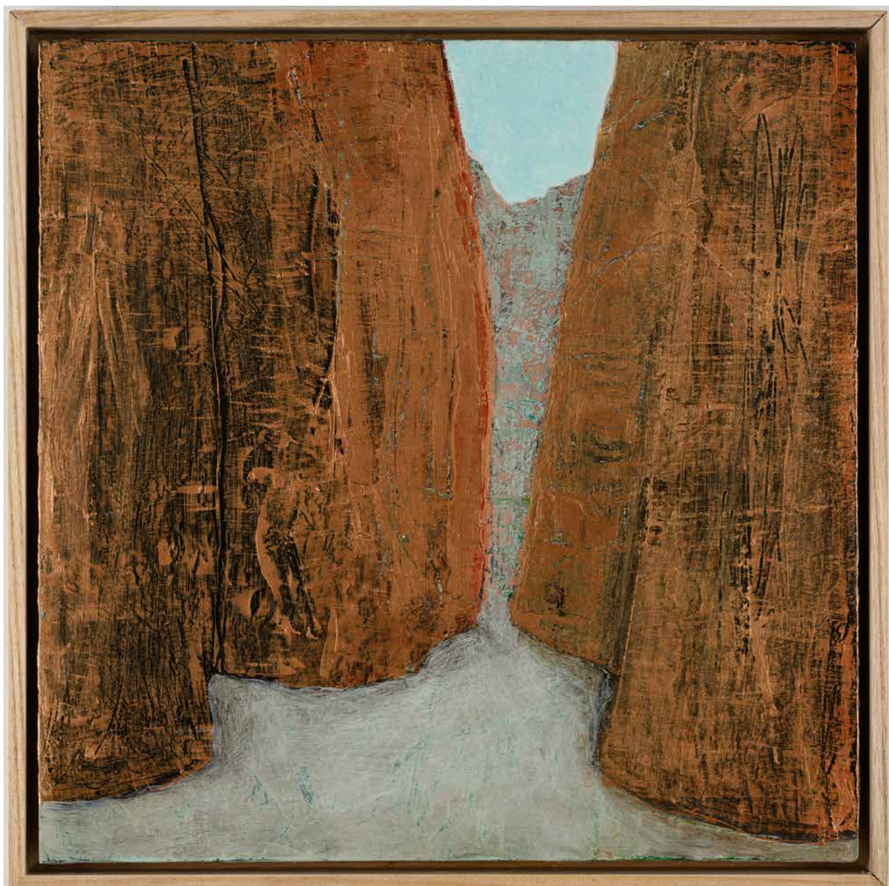
Where it began , 2024, acrylic on birch, 320 x 320 mm $1250