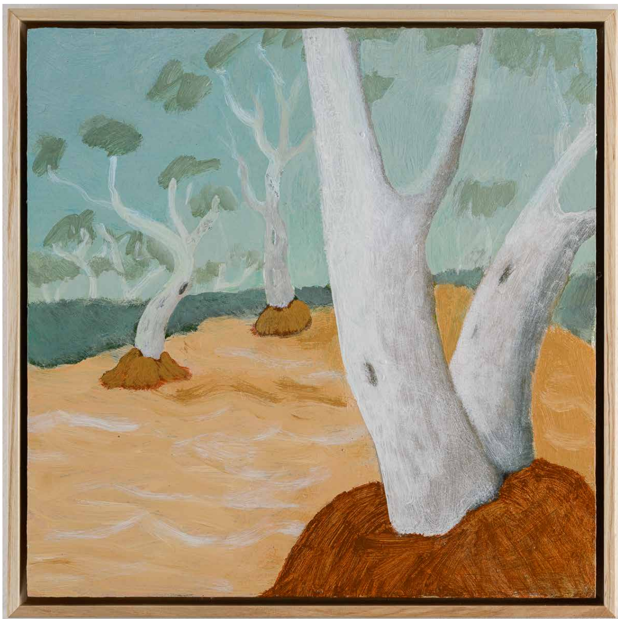
Dry , 2025, acrylic on birch, 320 x 320 mm $1250