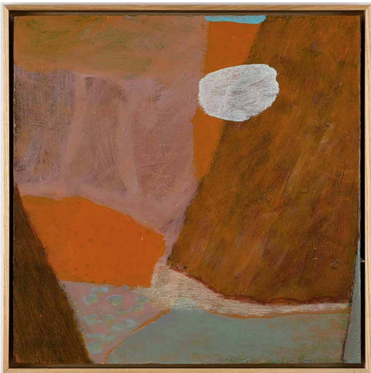
Figment , 2025, acrylic on birch, 420 x 420 mm $1600