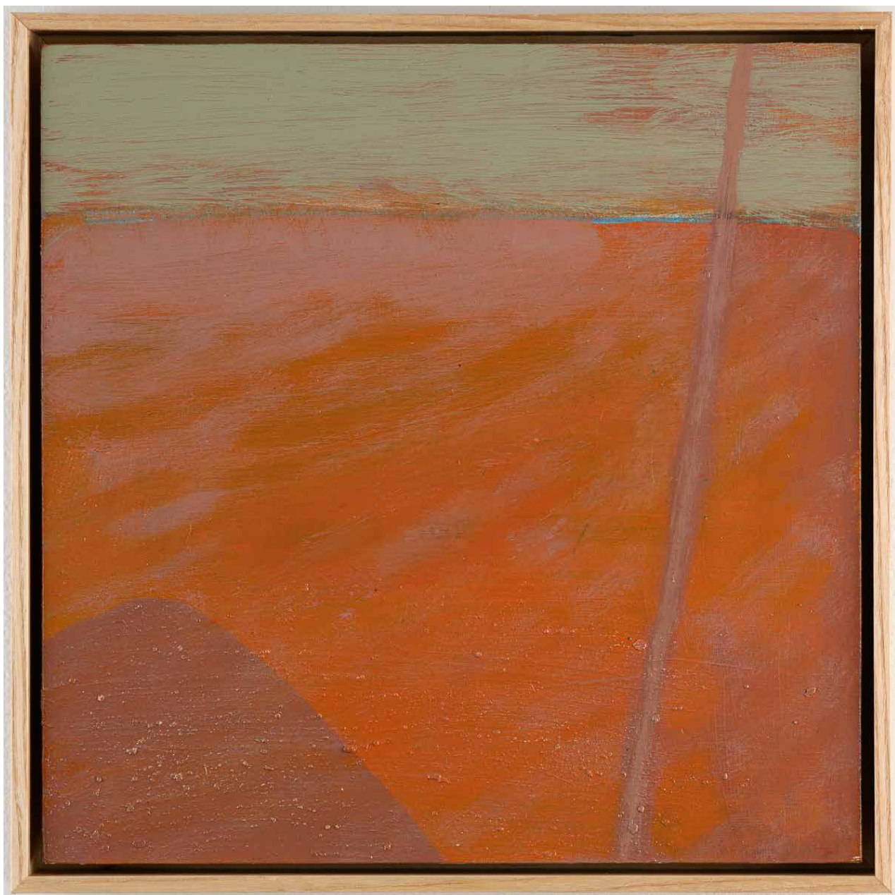
Small painting of a big place , 2025, acrylic on birch, 320 x 320 mm $1250