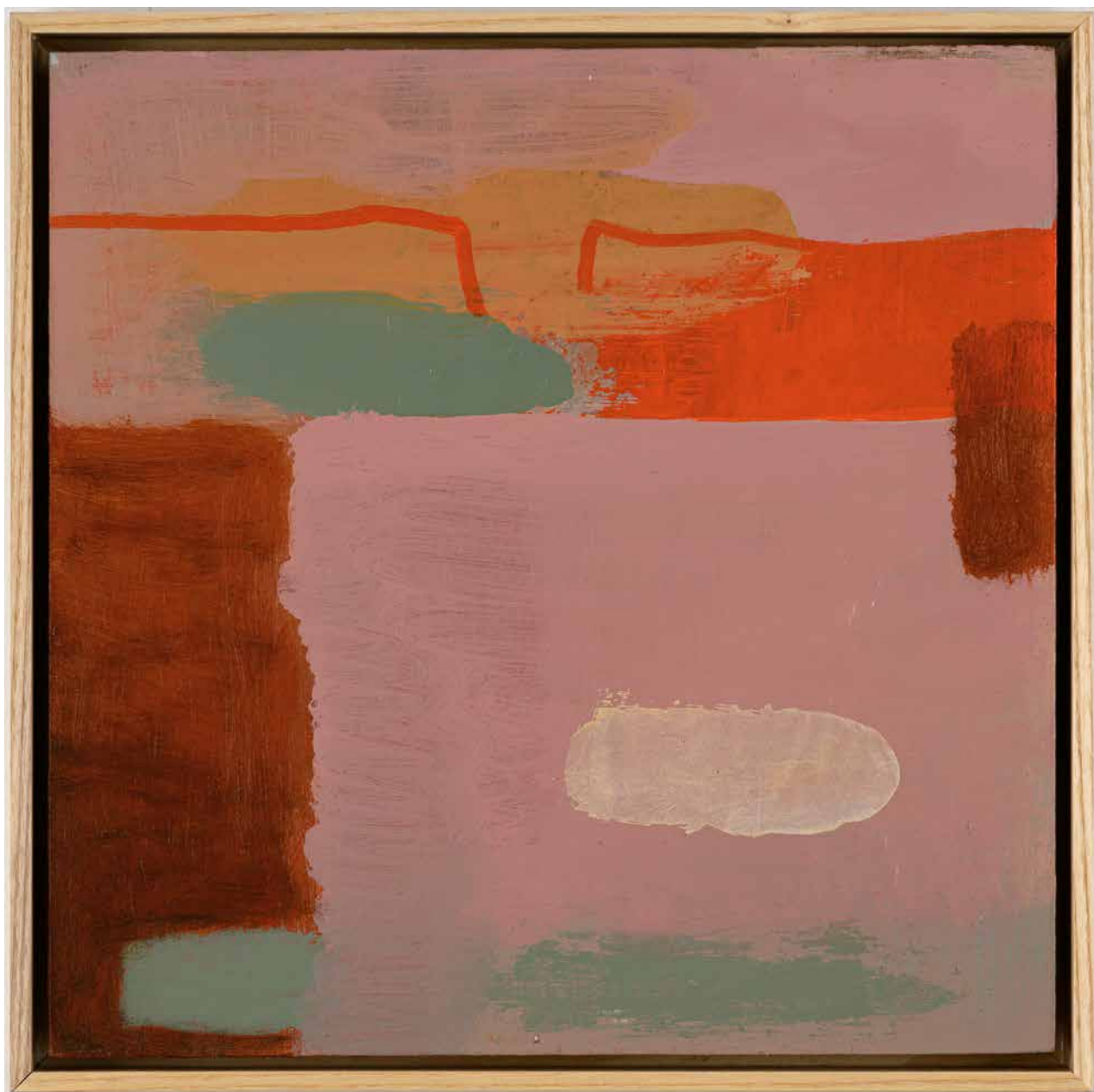
All the times , 2025, acrylic on birch, 320 x 320 mm $1250